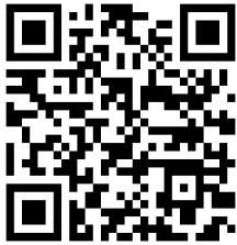
QR Code for School App

SCHOOL MOBILE APP: The mobile school app is accessible for all students and parents. The official school app and the only one supported and updated by the school is called Kitsilano Secondary School and is operated by Honeygarlic Software. Search for "My School Day" in the Apple App or Google Play store or scan this QR Code.